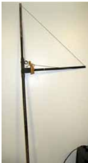
Another style of "hoop"