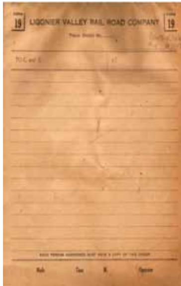
Left Blank Pad of Form 19s for the Ligonier Valley RR.

The Ligonier Valley Rail Road used Form 19s. We have a pad of the orders at the Museum as well as a completed order and two different varieties of hoops.