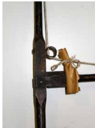
Detail of affixing order to "hoop."