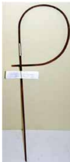
The "hoop" we have at the Ligonier Valley Rail Road Museum is about 65" tall.