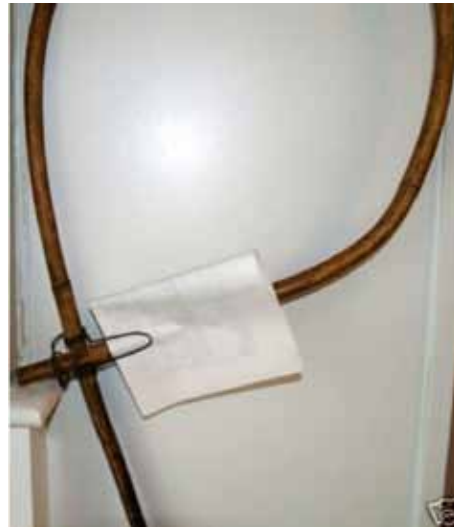
Detail of one method of affixing the order to the "hoop."