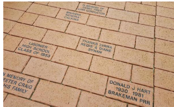
A sample distribution of bricks in the memorial walkway

To date, 93 persons have purchased 125 bricks for the brick walkway from the parking lot to the caboose. Listed on the back page is a roster of the donors who have purchased bricks. If your name is not included, orders are still being accepted. Order forms are available through the website www.lvrra.org or by calling 724-238-7819.