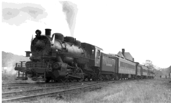
The Ligonier Valley Rail Road's Engine # 4025, an 0-6-0, was known as Little Joe.

Several other highly successful wheel arrangements emerged, including the S118 class of narrow-gauge 2-8-2s (Mikado), the well-known S-160 class of 2-8-0s (Consolidation), with 2,120 examples built, and S200 class of 2-8-2s. Of particular mention in this case is the often-forgotten S115 class of 0-6-0s. Constructed in 1942 primarily by the American Locomotive Company (Alco), these locomotives were able to maintain a greater duration of operating time, due to a tender for hauling coal.