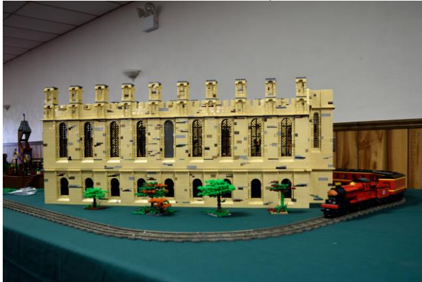
At Huber Hall, the Pittsburgh Lego User Group featured a layout focused on a Harry Potter theme.