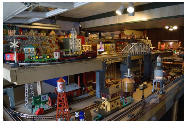
Dave Somerville's three-tiered layout shows what can be accomplished with limited space.