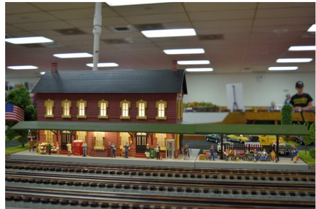
The modules of the Pittsburgh Hi-Railers were combined to create a four-track mainline measuring 30 X 40 feet.