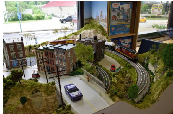
Brady's Train Outlet had three layouts in operation during the tour.