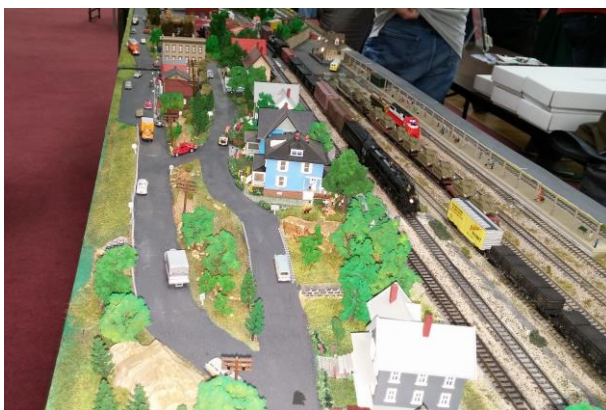
Also at Huber Hall, the Steeltown N-Scalers displayed several modules of their traveling layout.