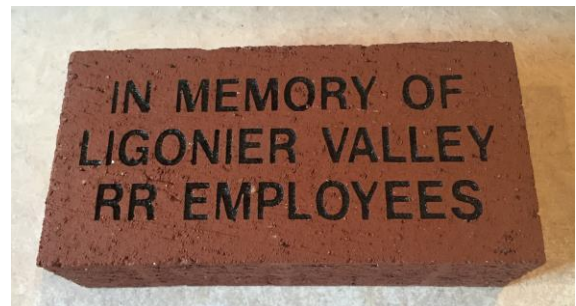
Loved ones can be honored or memorialized as shown in this sample.

Thanks to a grant awarded by the Ligonier Valley Endowment, and several anonymous donations, work has begun on creating a memorial brick walkway from the parking lot to the caboose. A featured marker will recognize the founders of the Ligonier Valley Rail Road, Judge Thomas Mellon and his sons. An application form is included with this edition of "The Liggie."